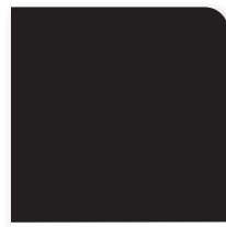
SATIN BLACK GN150A