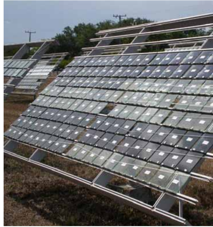
Figure 4: Exposure testing conducted in Miami, Florida, USA.

Please contact your Saflex Sales Manager, Customer Service Representative or visit www.eastman.com/saflex for further information.