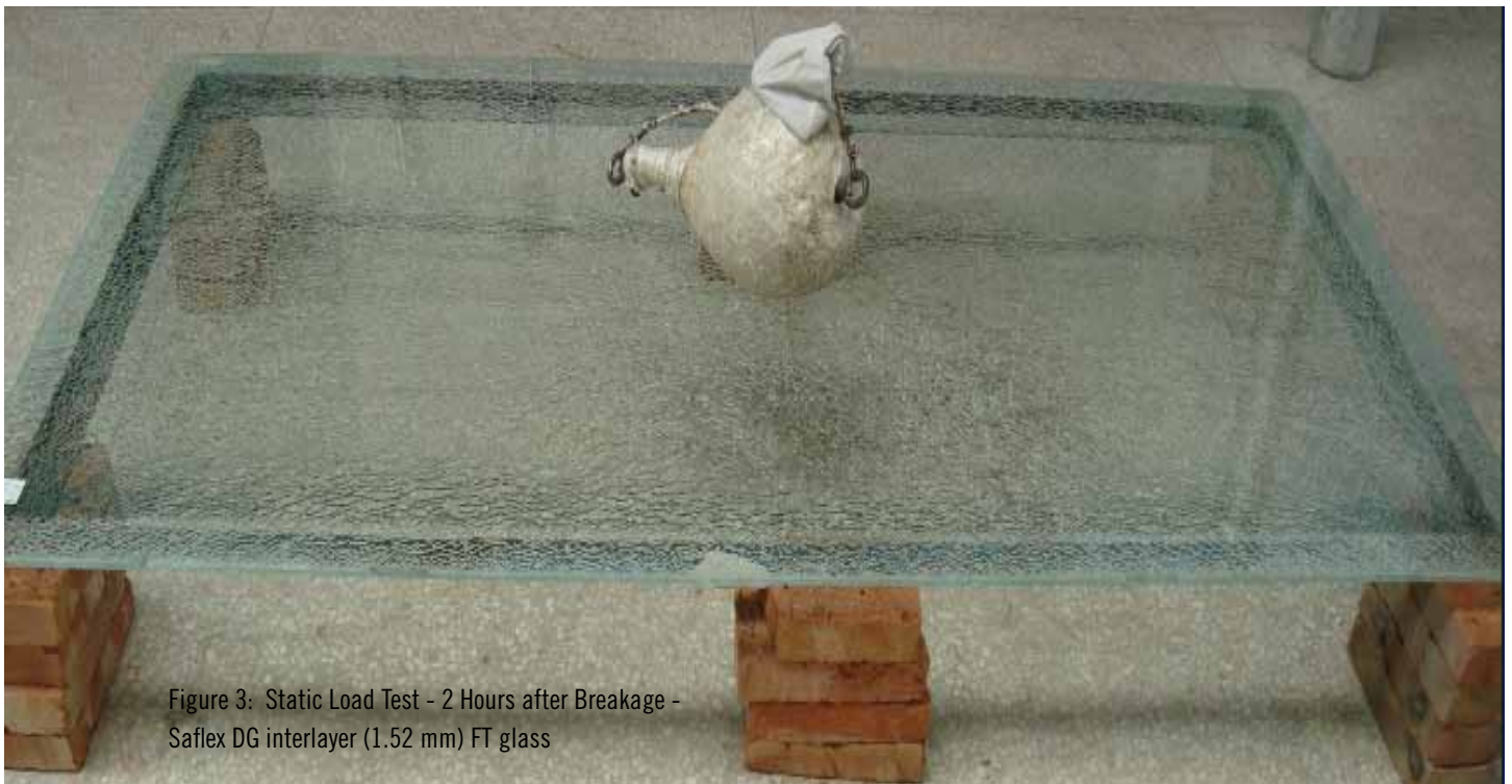
Figure 3: Static Load Test - 2 Hours after Breakage - Saflex DG interlayer (1.52 mm) FT glass

Saflex DG structural interlayer has been successfully tested for performance in security glazing applications in accordance with EN 356. Security glazing is designed accounting for several variables. For specific security applications, Saflex DG structural interlayer should be tested in the desired configuration to ascertain acceptability.