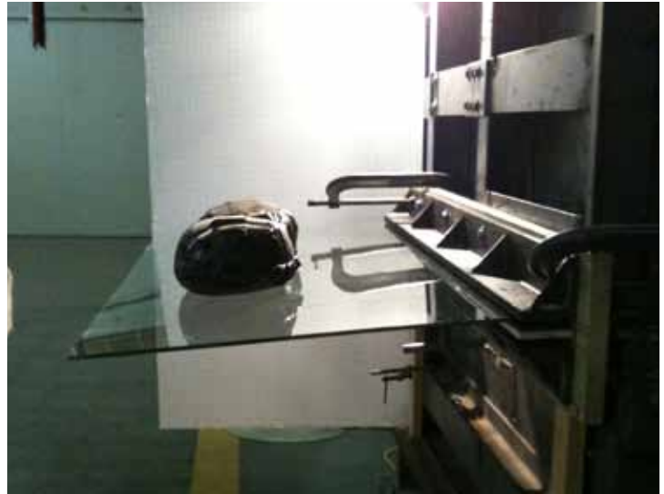
Figure 2: Canopy Test - Broken Laminate - Saflex® DG - 34 kg (75 lbs) HS glass

Saflex DG has been tested in single side balcony and canopy applications with one or both sides of glass broken. When using annealed or heat-strengthened (semi-toughened) glass, the laminate is able to stand even after breakage. Saflex DG structural interlayer has a unique rheology when compared to standard PVB interlayers. It exhibits very high shear modulus at common temperatures and this modulus extends well past that of standard PVB. In fact, Saflex DG is one hundred times stiffer than standard Saflex R series interlayer whereas Saflex R series has a shear modulus of 3 MPa, Saflex DG has a Shear modulus of 300 MPa at the same temperature.